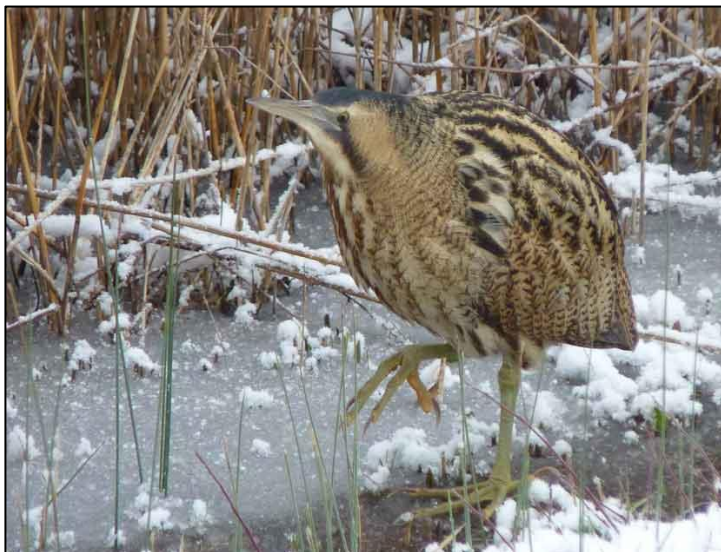
Bittern at Rye Harbour Nature Reserve