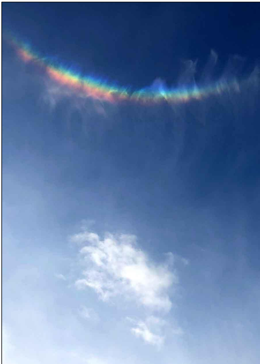
An unusual upside-down rainbow (or circumzenithal arc, to be precise) caused by the refraction of sunlight through ice crystals rather than through raindrops. Photographed over Icklesham by Carole Fuggle