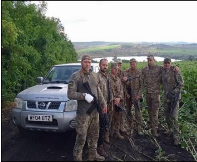
The truck being used by resistance fighters in Ukraine.

They managed the journey from Wiltshire to Krakow, which took only 48 hours, by doing a driving relay.