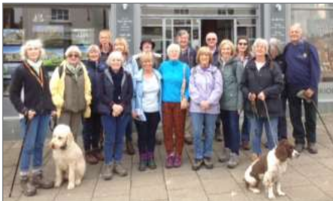
Winchelsea Rotary walkers 2019

Rye and Winchelsea Rotary Club are hoping to go ahead with a couple of outdoor events which you may be interested in.